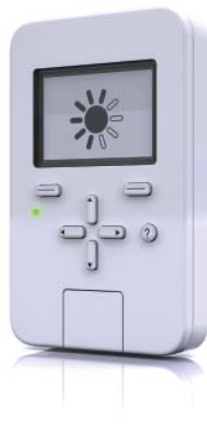
Flush mounted control unit