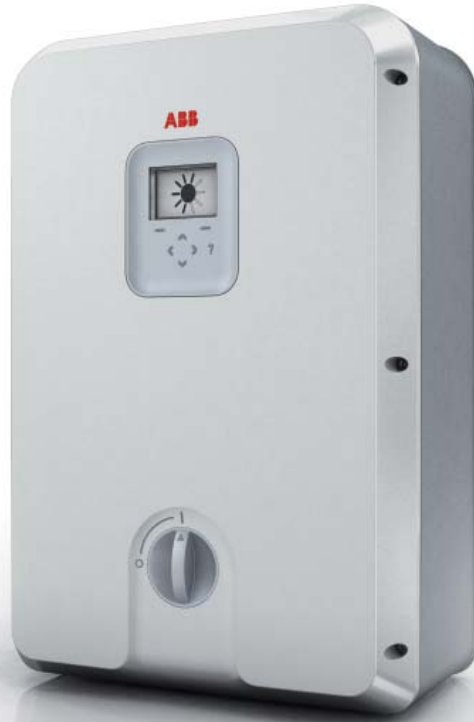
ABB string inverters cost-effectively convert the direct current generated by solar panels into high-quality alternating current that can be fed into the power network. Designed to meet the needs of the entire supply chain – from system integrators and installers to end users – these transformerless, single-phase inverters are suitable for small and medium-size photovoltaic systems connected to the public electricity network.