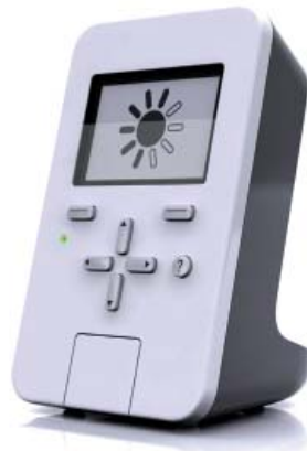
Control unit with table stand