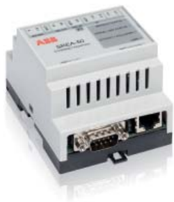
Remote monitoring adapter

© Copyright 2011 ABB. All rights reserved. Specifications subject to change without notice.